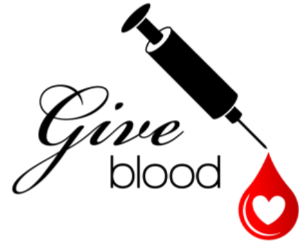
PHOTO I.D. IS REQUIRED

Please come to save lives & support the Boy Scouts Pancake Breakfast event (blood donors get a discount)!